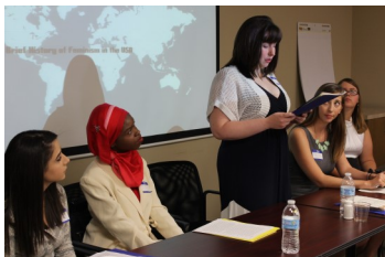
Pictured are students who attended NCCWSL in 2013 presenting at the AAUW/OK 2013 Summer Leadership Conference in Oklahoma City.