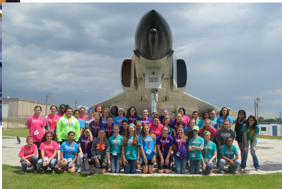
TechTrekks at SWOSU