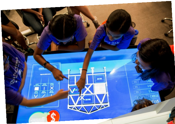
Evaluating different building materials and arrangements to withstand natural and man-made disasters at the interactive STEM Exhibit at the Oklahoma City National Memorial & Museum.