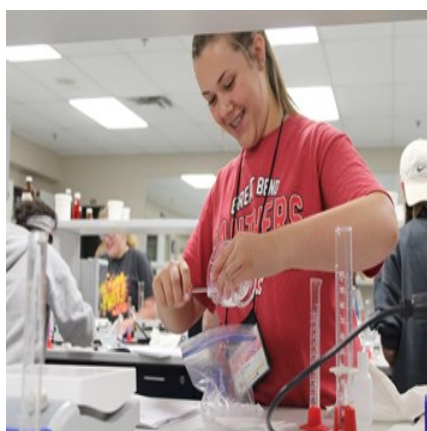
Compounding anti-itch gel in the SWOSU Pharmacy Calculations Workshop.