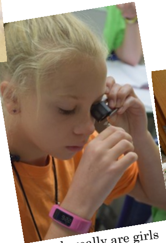
Campers learn that diamonds really are girls best friend from Kelley Jewelers during the OCAST Science Core Course.