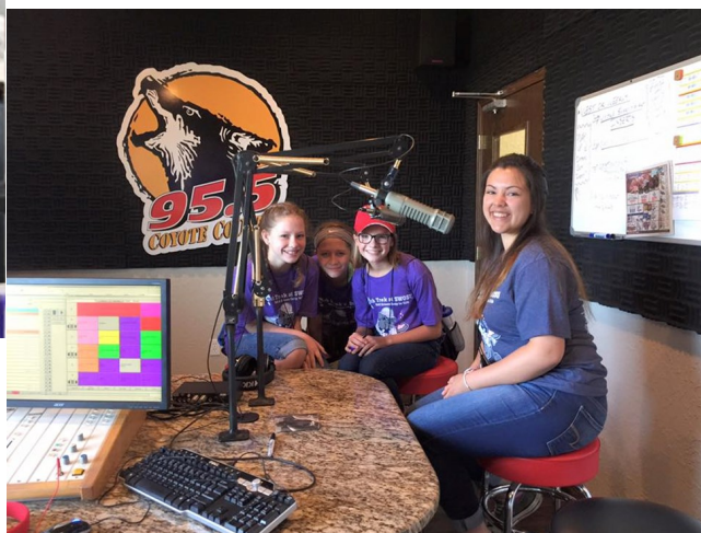
Live radio interview at Wright Radio with three campers and one Junior Counselor.