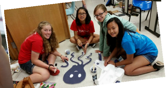
Engineering an octopus to display sound, lights, and movement in the Marathon Oil Robotics Workshop.