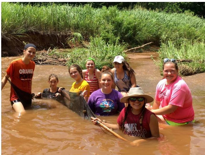
Evaluating water quality in Deer Creek during the Blue Thumb Workshop.