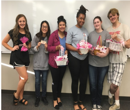
Students helping with the event and their field of study (l to r):

The SWOSU AAUW Student branch helped raise awareness of breast cancer in both women and men during “Breast Cancer Awareness Month” (October). Pink ribbon-themed items were put into baskets and placed in the female and male residence halls at SWOSU. The giveaways items included bracelets, hair ties, buttons, duckies, and pencils. Breast cancer is the most common cancer in American women. Breast cancer is not only a disease that females get; men can also get breast cancer.