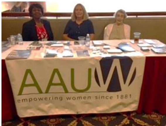
Sitting at the AAUW table at CTEEC are (l to r):

Each Fall, the Career and Technical Education Equity Council (CTEEC) meets in Tulsa. AAUW/OK supports our branches having an information table there so AAUW can be introduced to the students and professors. The mission of CTEEC is “Increasing the effectiveness of career and technical education through focusing on high expectations and full participation for all students and employees in career and education.” AAUW information is given out to prospective members.