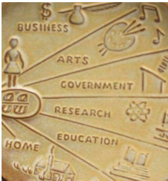
AAUW plate by Frankoma Pottery.