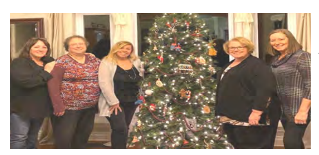
November 25 – Branch members celebrated the holidays at the annual Party Potluck and Dirty Santa gift exchange.