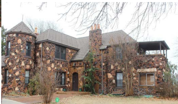
Rook Mansion in Watonga, Oklahoma