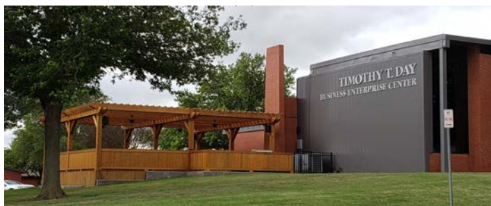
Timothy J. Day Business Enterprise Center at SWOSU