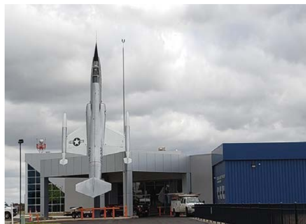
Stafford Air & Space Museum