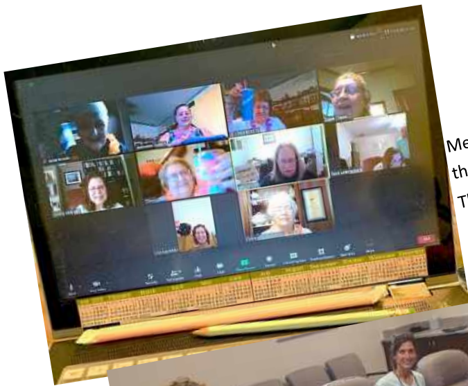
Members socializing during the Zoom Happy Hour on Thursday, June 9.