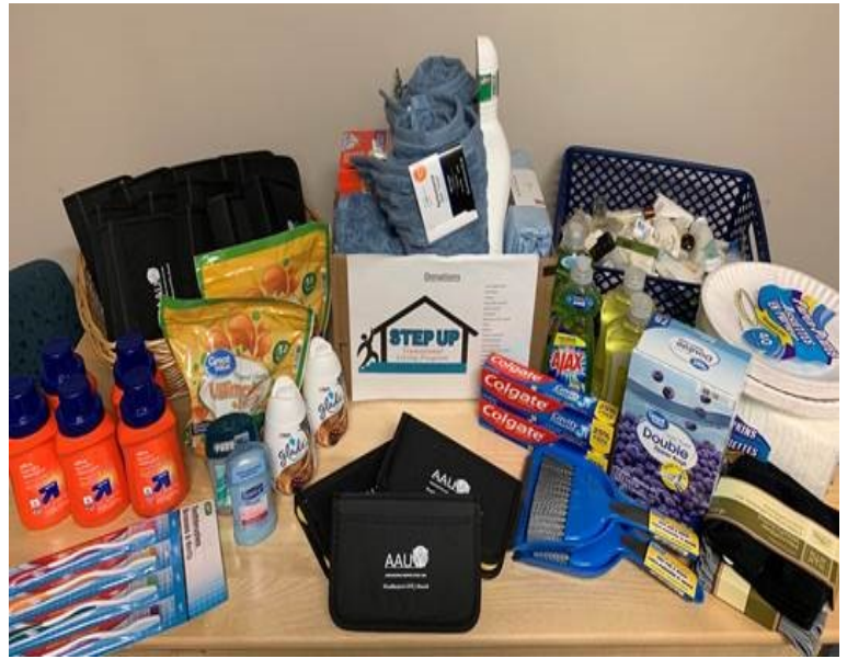
The Weatherford branch is donating these items to the STEP UP Transitional Living Program. Notice the AAUW bags that are ready to go.

The Weatherford branch purchased 25 toolkits to help get individuals started in their own homes. Each 23-piece tool kit includes a measuring tape; ratchet, socket, and screwdriver set; and allen wrenches inside of a cloth bag with "AAUW" printed on the cover. Individual branch members also contributed home goods such as cleaning supplies and toiletries.