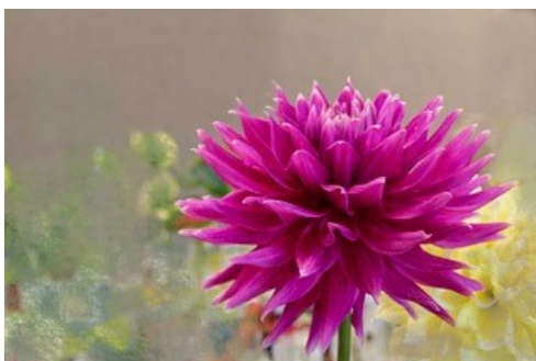
"I Bring the Bold"