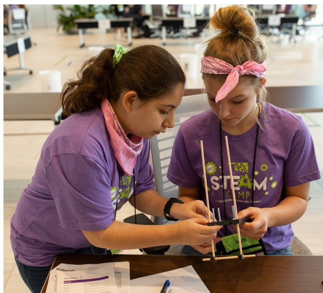
Campers work together on hands-on projects, such as creating a functional catapult at Baker-Hughes during the field trip to OKC.