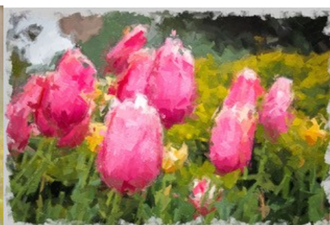
"Bending and Blending"

Art Contest www.aauw.org/resources/member/initiatives/art-contest