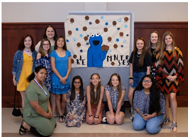
Campers celebrate their successes at the Graduation and Awards Banquet at the end of the 2019 camp.